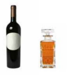
Alcoholic Beverages are not permitted to the USA & restricted to many other countries.