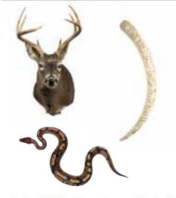
Animal Skins (non-domesticated), Furs, Ivory & Live Animals